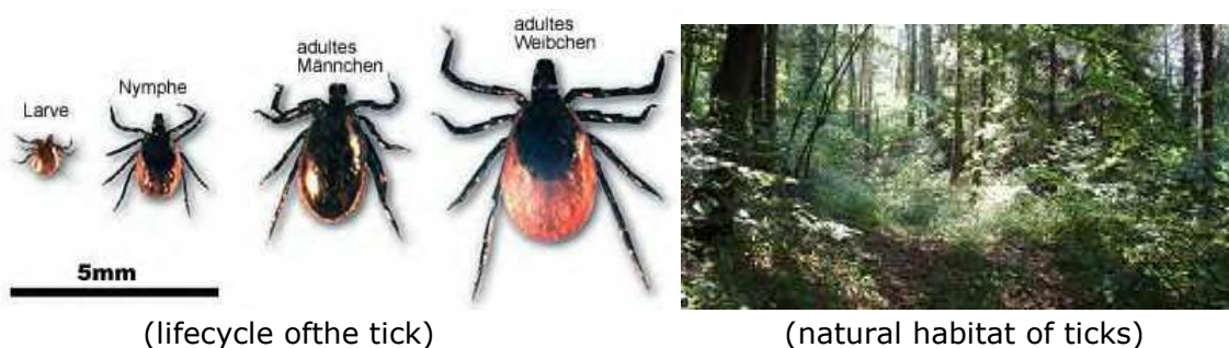
(lifecycle of the tick)

A female tick lays its eggs and the larvae hatch. After feeding on blood, the larvae develop over the course of several weeks into so-called nymphs and then into adult ticks. Ticks are dependent upon sucking blood in all three phases of their lifecycle. After each meal of blood, they leave their host. The larvae are less than half a millimeter in size, and thus barely visible to the naked eye.